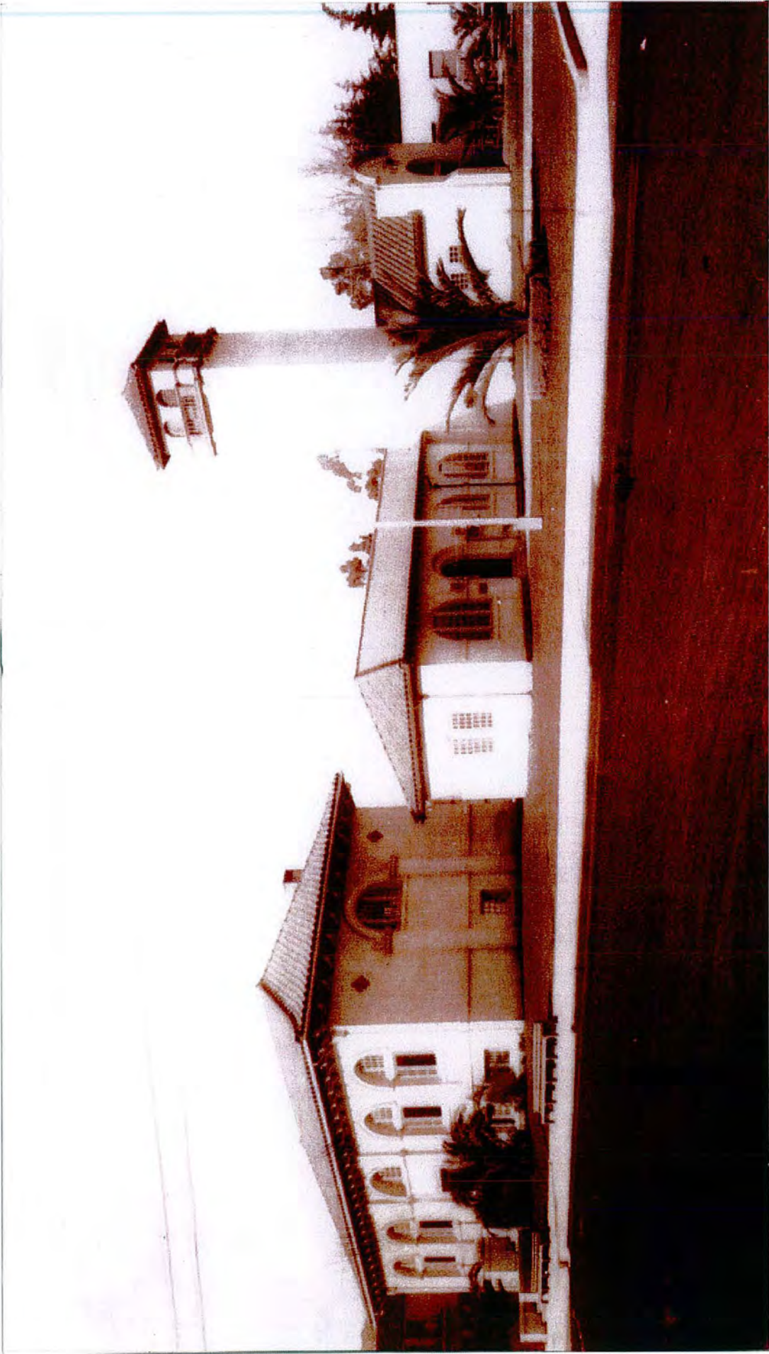
Town Hall and Library 1920