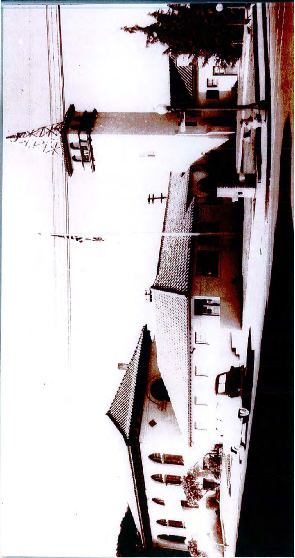
Town Hall and Library 1930