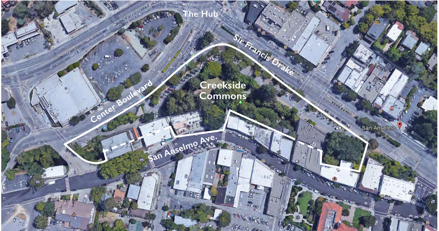
Approximate Project Boundary

Creekside Commons is approximately 1.1 acres, located on the southwest corner of the 'Hub' intersection where Sir Francis Drake Boulevard, Red Hill Avenue and Center Boulevard converge. https://www.townofsananselmo.org/286/Public-Works